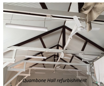
Quambone Hall refurbishment

the Co - Operative has been busy dressing up the main street with their 'Wacky Windows' initiative. Other projects are well on target for completion by the deadline.