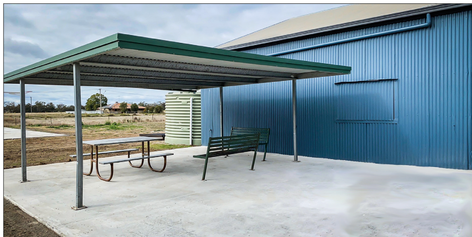
Gulargambone Youth Centre renovations are nearing completion.

External renovation work on the Gulargambone Youth Centre by a local contractor is nearing completion.